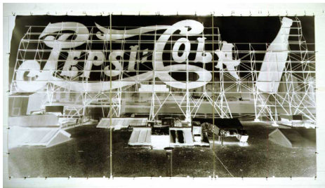
Vera Lutter , Pepsi Cola, Long Island City, VIII, June 24, 1998 , 1998. Unique gelatin silver print, 90 x 168 inches.