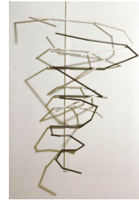
Al Taylor , Untitled , 1988. Brass, wood and paint, 94 x 62 x 30 inches.