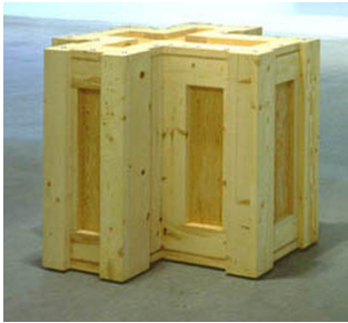
Richard Artschwager , Untitled , 1994. Wood and metal hardware, 35 x 35 x 41 inches.