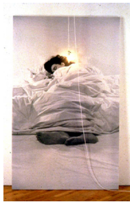
Annette Lemieux , Sleep Interrupted , 1990/91. Latex on canvas with light fixture, 96 x 60 inches.