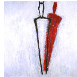
Susan Rothenberg , Tuning Fork , 1980. Acrylic and Flashe on canvas, 82 x 79 inches.