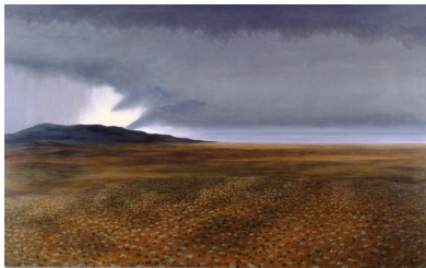
April Gornik , Untitled (Moving Storm) , 1981. Oil on canvas, 60 x 95 7/8 inches.