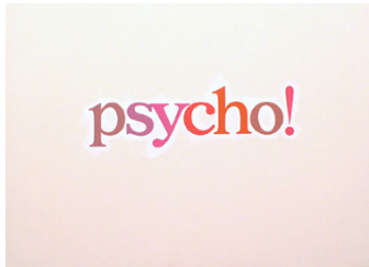
Ricci Albenda , psycho! , 2004. Acrylic on wood panel, 18 x 24 inches.