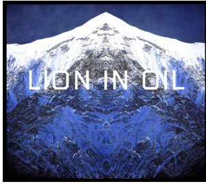
Edward Ruscha , Lion in Oil , 2002. Acrylic on canvas, 64 x 72 inches.