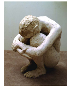
Robert Gober , Crouching Man , 1982. Plaster, wood and wire, 25 x 24 x 18 inches.