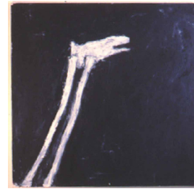
Susan Rothenberg , Double Bones , 1979. Acrylic and gesso on canvas, 39 1/4 x 37 inches.