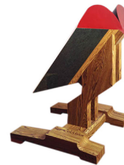
Richard Artschwager , Diderot's Last Resort , 1992. Formica on wood, 54 1/2 x 54 x 43 inches.