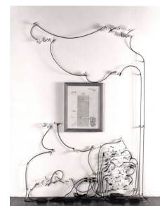
Joseph Kosuth , Fetishism (Corrected) #7 , 1988. Offset on paper in wood frame, neon, 104 1/2 x 72 inches.